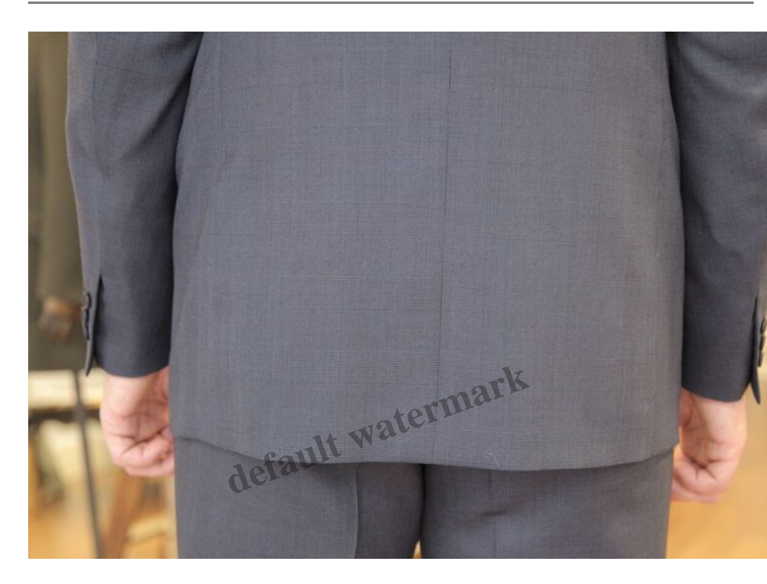
Waistband & pleats